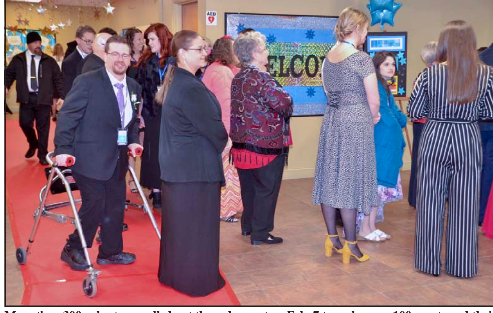
More than 300 volunteers rolled out the red carpet on Feb. 7 to make over 100 guests and their buddies feel special on their "Night to Shine."

The night continued with a dinner before guests split into groups of three to either hit the dance floor, take a spin on the party bus or participate in karaoke.